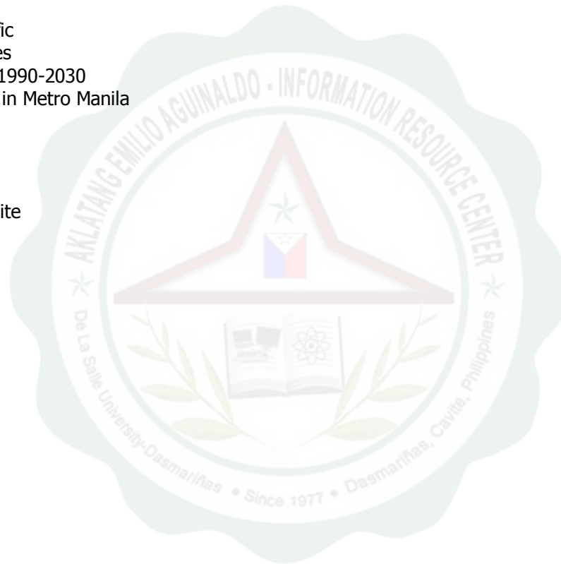
Figure no.68 Ventilation Concept